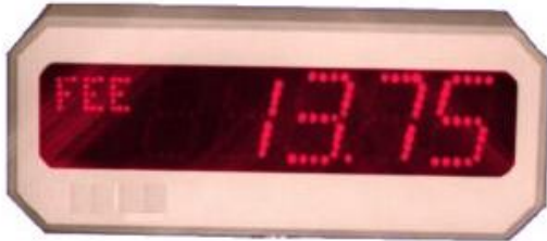
Model FDO Electronic Fee Display

Current parking control applications demand rugged, well built system components designed for years of reliable, trouble free operation. This is true regardless of climate, or number of duty cycles per day. Your parking applications need and deserve products that are engineered for a high degree of reliability, and they require the flexibility to fit perfectly in a wide variety of system applications.