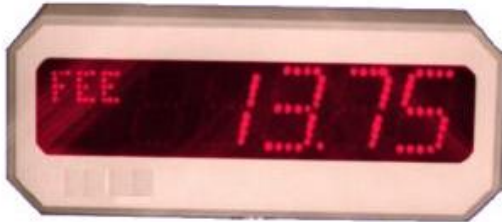
Model FDO Electronic Fee Display

Current parking control applications demand rugged, well built system components designed for years of reliable, trouble free operation. This is true regardless of climate, or number of duty cycles per day. Your parking applications need and deserve products that are engineered for a high degree of reliability, and they require the flexibility to fit perfectly in a wide variety of system applications.